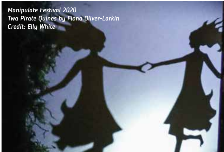
Manipulate Festival 2020 Twa Pirate Quines by Fiona Oliver-Larkin