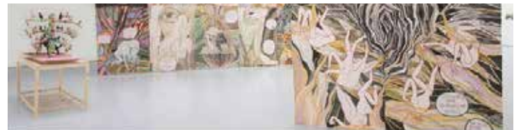
An installation view of Ghost Calls by Emma Talbot at Dundee Contemporary Arts

A series of online workshops for young people, school leavers and those not in employment, further education or training - exploring drawing, film making, sculpture from found and recyclable materials and clay. Full programme details: http://outsokenarts.org/workshops/ First workshop - Tue 16 Feb | 5-7pm - Drawing with Katie McGroarty https://us02web.zoom.us/j/84461212701