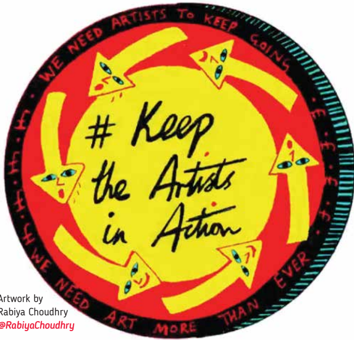
Artwork by Rabiya Choudhry @RabiyaChoudhry